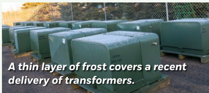
A thin layer of frost covers a recent delivery of transformers.

To counteract these challenges, BEC has adjusted its approach. Riewer mentions, "We've adapted, ordered supplies earlier, and held some equipment longer in inventory to avoid construction delays. Our changes have helped shield us a bit from the continually increasing costs."