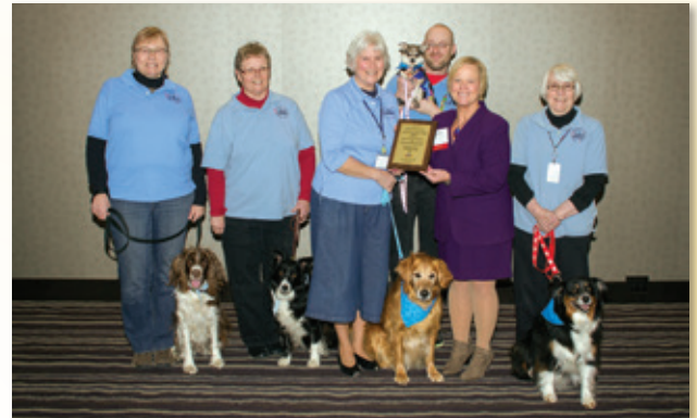
2014 award winner - Bemidji Area Reading Canines