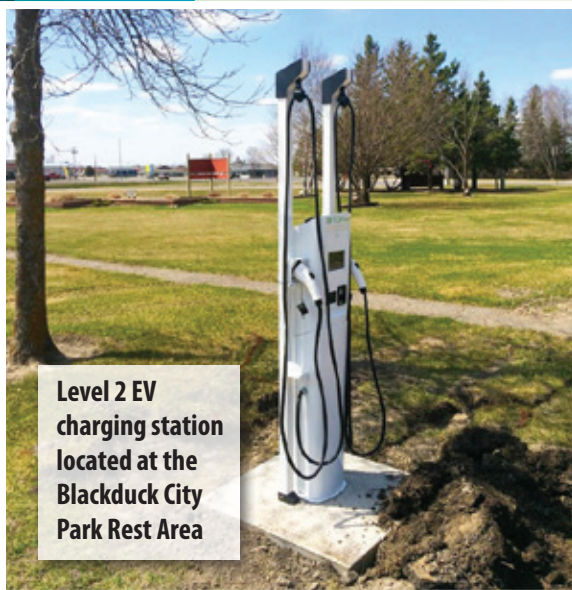
Level 2 EV charging station located at the Blackduck City Park Rest Area

As the market for electric vehicles (EVs) continues to grow, the charging infrastructure to support them needs to follow. A growing number of businesses across the state are installing EV charging stations, as are retailers, parks and gas stations. In an effort to reduce range anxiety and encourage the adoption of EVs in our region, Beltrami Electric Cooperative has partnered with the city of Blackduck and the Big Bog State Recreation Area to install two public Level 2 EV chargers. These chargers provide 240 volts and average between 2-8 hours for a full charge. Beltrami Electric has added a third charging station, which includes both a Level 2 (240-volt) and a Direct Current (DC) fast charger, at our headquarters building near the community solar garden.