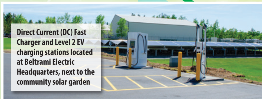
Direct Current (DC) Fast Charger and Level 2 EV charging stations located at Beltrami Electric Headquarters, next to the community solar garden