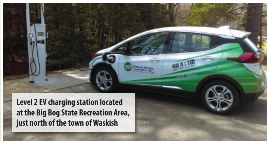
Level 2 EV charging station located at the Big Bog State Recreation Area, just north of the town of Waskish