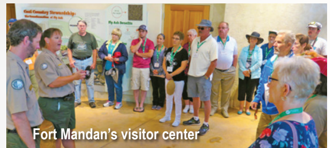
Fort Mandan's visitor center

Our third and final day featured a visit to the Lewis & Clark Interpretive Center and Fort Mandan in Washburn, N.D. Fort Mandan's visitor center is a prime example of environmental stewardship.