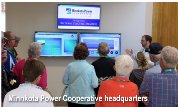
Minnkota Power Cooperative headquarters