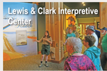
Lewis & Clark Interpretive Center

The final stop of the day was Garrison Dam and Powerhouse near Riverdale, N.D., where our hydroelectric power is produced. Members learned about the history and