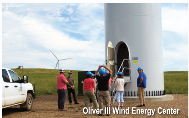
Oliver III Wind Energy Center

After a stop in Casselton for lunch, we continued our journey west to Center, N.D., to visit the Oliver III Wind