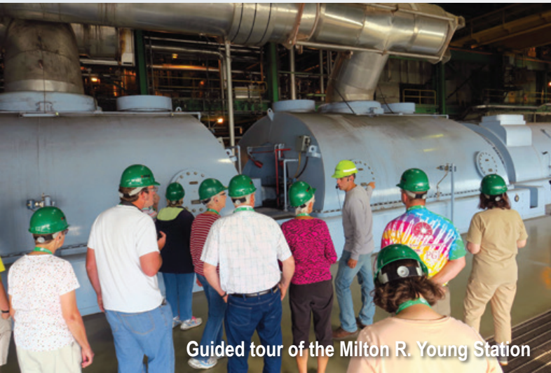
Guided tour of the Milton R. Young Station