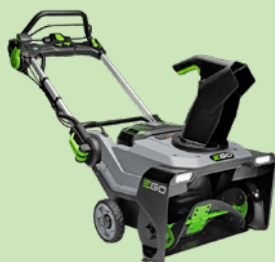
EGO™ Power+ 56-Volt Single-Stage Snow Thrower ($599.99)