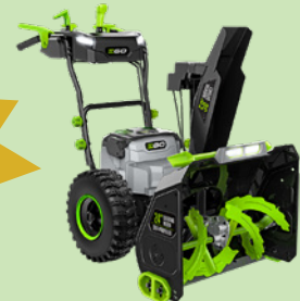
EGO™ Power+ 56-Volt Two-Stage Snow Blower ($1,299.99)