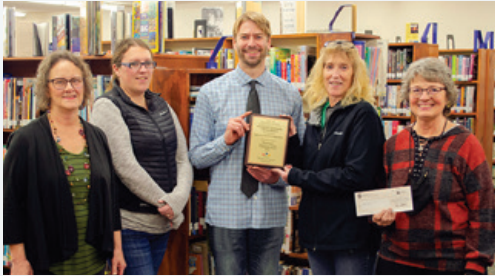
The 2021 Touchstone Energy Community Award recipient was the Blackduck Community Library Board. The library provides a safe place for area children to spend their spare time while learning new things.

Do you know an organization that has made outstanding contributions to our local community?