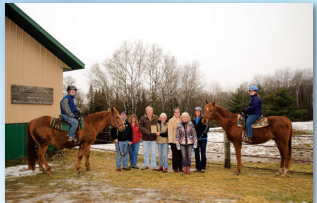
2015 award winner - Jack Pine Stables