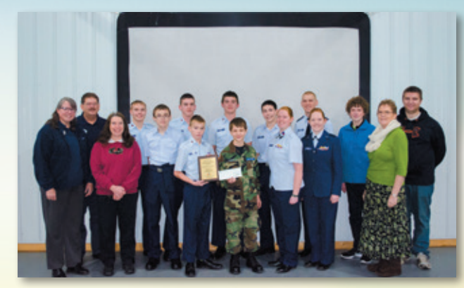
2016 award winner: Northland Composite Squadron-Civil Air Patrol

For information and to download an application, please visit our website at www.beltramielectric.com.