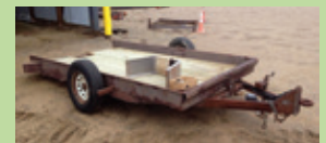
2003 Felling FT3 tilt-bed trailer. Fixer upper. Minimum bid: $200.

Item is available for viewing at Beltrami Electric from Nov. 5 through Nov. 8 up to 4:30 p.m. Item sold "as-is." Cash only.