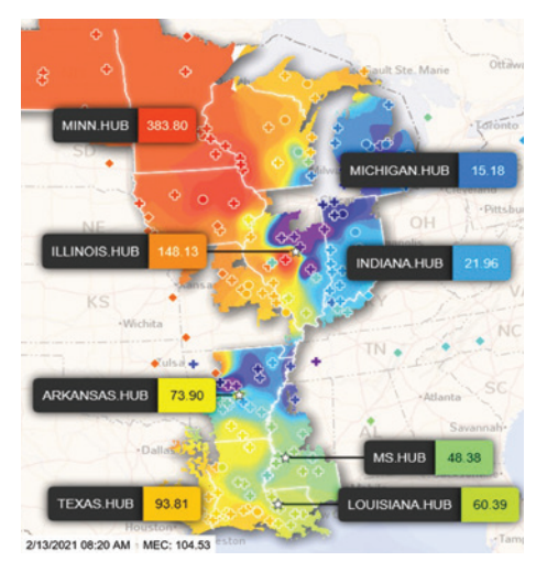
A screen capture from Feb. 13, 2021, shows how high energy market prices had risen in the north at the beginning of the polar vortex, hundreds of dollars higher than average.

To learn more, read "Power over the market" at news.minnkota.com .