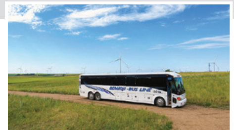
Oliver III Wind Energy