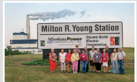
Milton R. Young Station